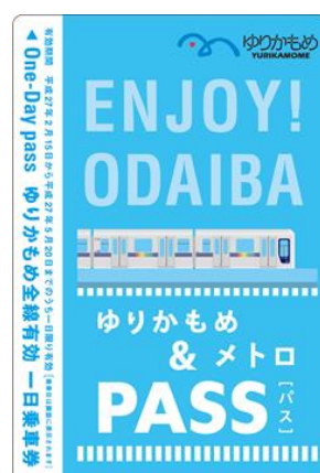
Yurikamome One-Day Pass