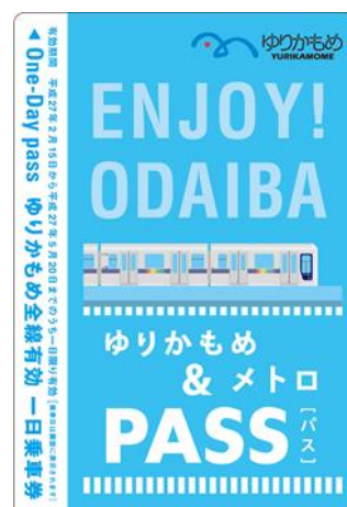
Tokyo Metro 1-Day Open Ticket + Yurikamome One-Day Pass