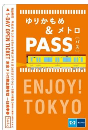
Tokyo Metro 1-Day Open Ticket