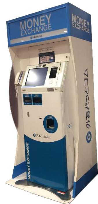
Visual representation of automatic money exchanger

For details on this matter, please see the attachment.