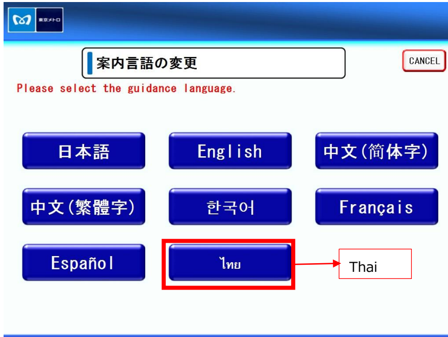
Language selection screen