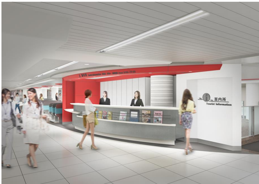
Tourist Information Counter at Tokyo Station (image representation)

Please see the attachment to this release for an overview of this endeavor.