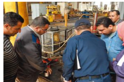
Technical assistance for operations and maintenance