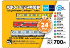
Various Styles of Ticket

By learning various Tokyo Metro's initiatives to increase revenue through ticket fares, you will discover hints for increasing fare revenue. From today's lecture, you will be able to learn about various ticket ideas that could be applied to your business.