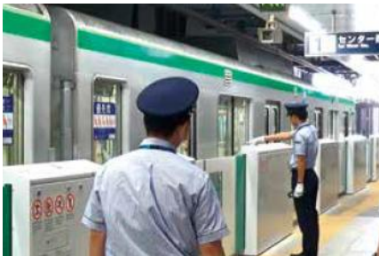
Technical assistance for the establishment of training centers

We are looking forward to hearing from you about your training consulting needs.