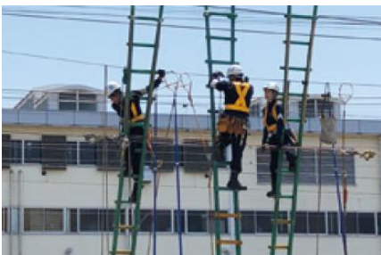
Development of training programs