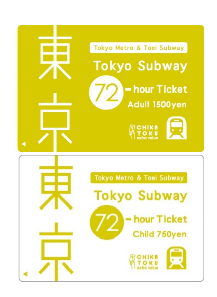
Tokyo Subway Tickets (Top: For Adults/Bottom: For Children)