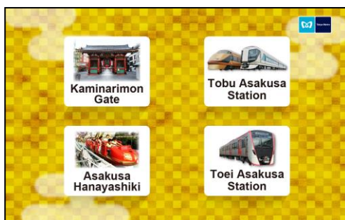
“Select facility in station surroundings to get directions to” screen (English)

Information on facilities in the station's surrounding area to which passengers are frequently given directions (Kaminarimon/Asakusa Hanayashiki/Tobu Asakusa Station/Toei Asakusa Station)