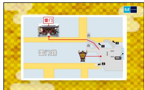
“How to get to Kaminarimon” screen (simplified Chinese)

*Screens shown are image representations.