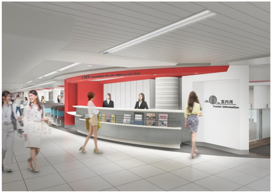
Tourist Information Counter at Tokyo Station (image representation)

Please see the attachment to this release for an overview of this endeavor.