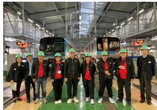
Onsite Course “Training in Tokyo”

For more details regarding Tokyo Metro Academy courses, please refer to the link below: