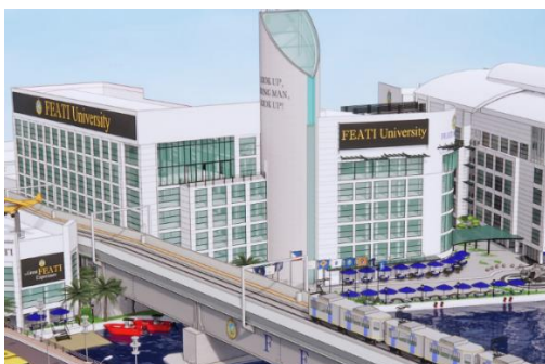
FEATI Univ.

The university has produced graduates who work in the railway sector for companies such as The Light Rail Manila Corporation and other railway operators in the Philippines. In recent years the university is also known for launching its Railway Engineering course.