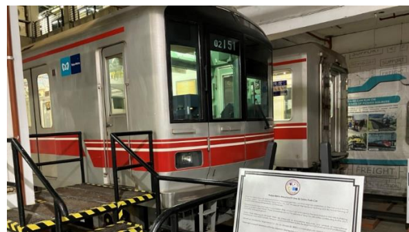
Display status of Series 02 RS