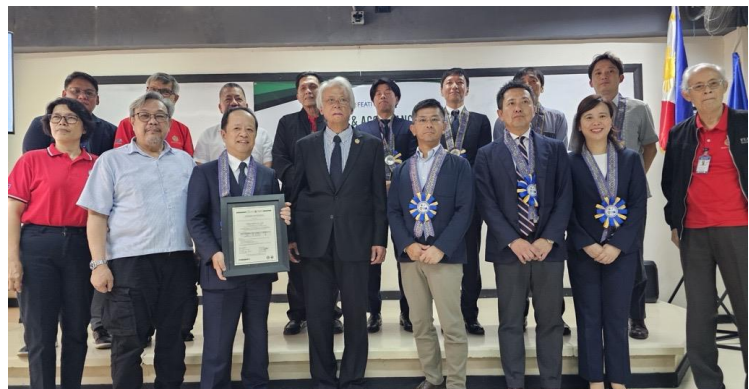
RS Equipment Handing Over Ceremony