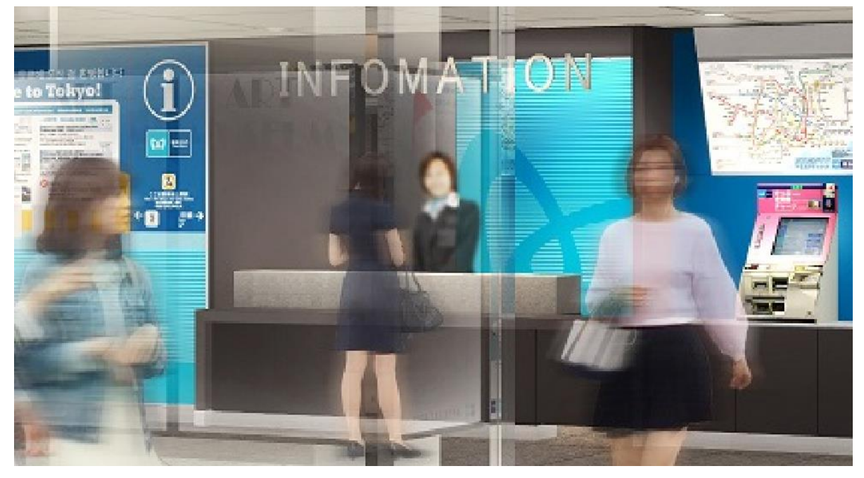
Passenger Information Desk at Ueno Station (image representation)

Please see the Attachment to this release for an overview of this endeavor.