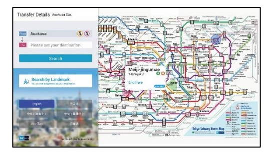
Subway route map search

The screen also displays the route and distance on foot from the station closest to the passenger's intended destination to that destination in addition to the time it takes to walk there.