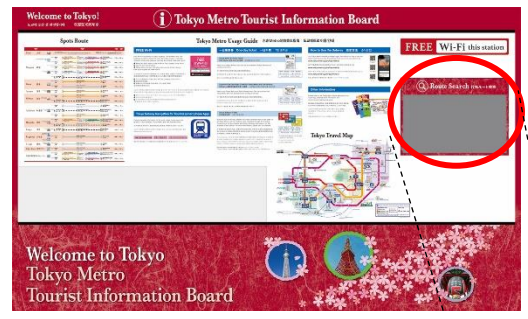
Example of Welcome Board design ("Tokyo SUBWAY Navigation for Tourists Plus" to be displayed in red circle area)

Please see the Attachment to this release for an overview of this endeavor.