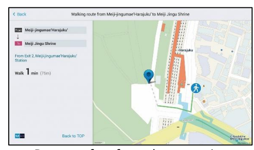
Route on foot from closest station to destination