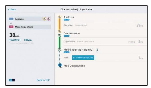
Subway route search results