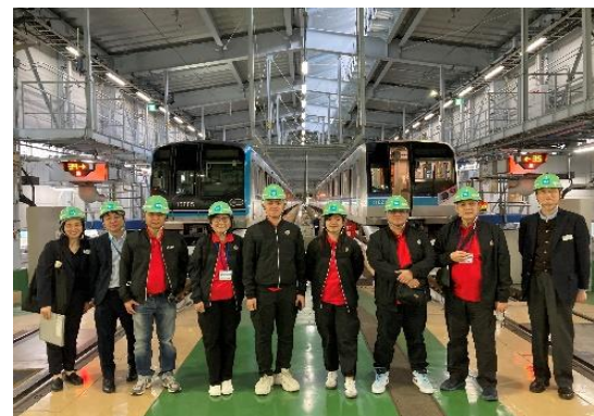
Training in Tokyo

*For more information on Online courses and Training in Tokyo, etc., please visit the following website: https://sites.google.com/tokyometroacademy.com/index