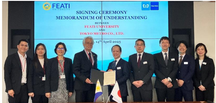
Memorandum of Understanding signing ceremony at Tokyo Metro Head Office