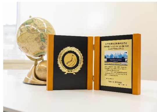
Special award at the 22nd Japan Railway Awards