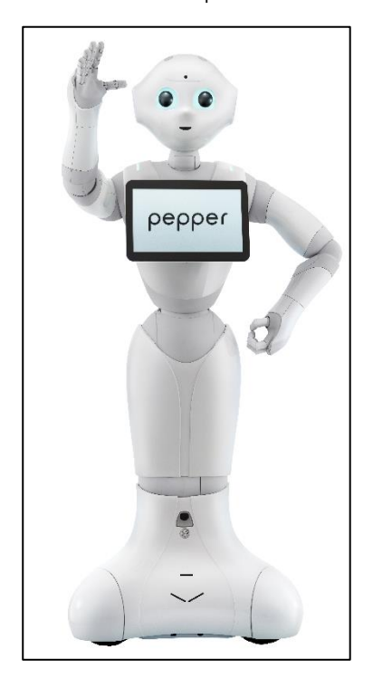
\hbox{@ SoftBankRobotics Corp. All rights reserved}.