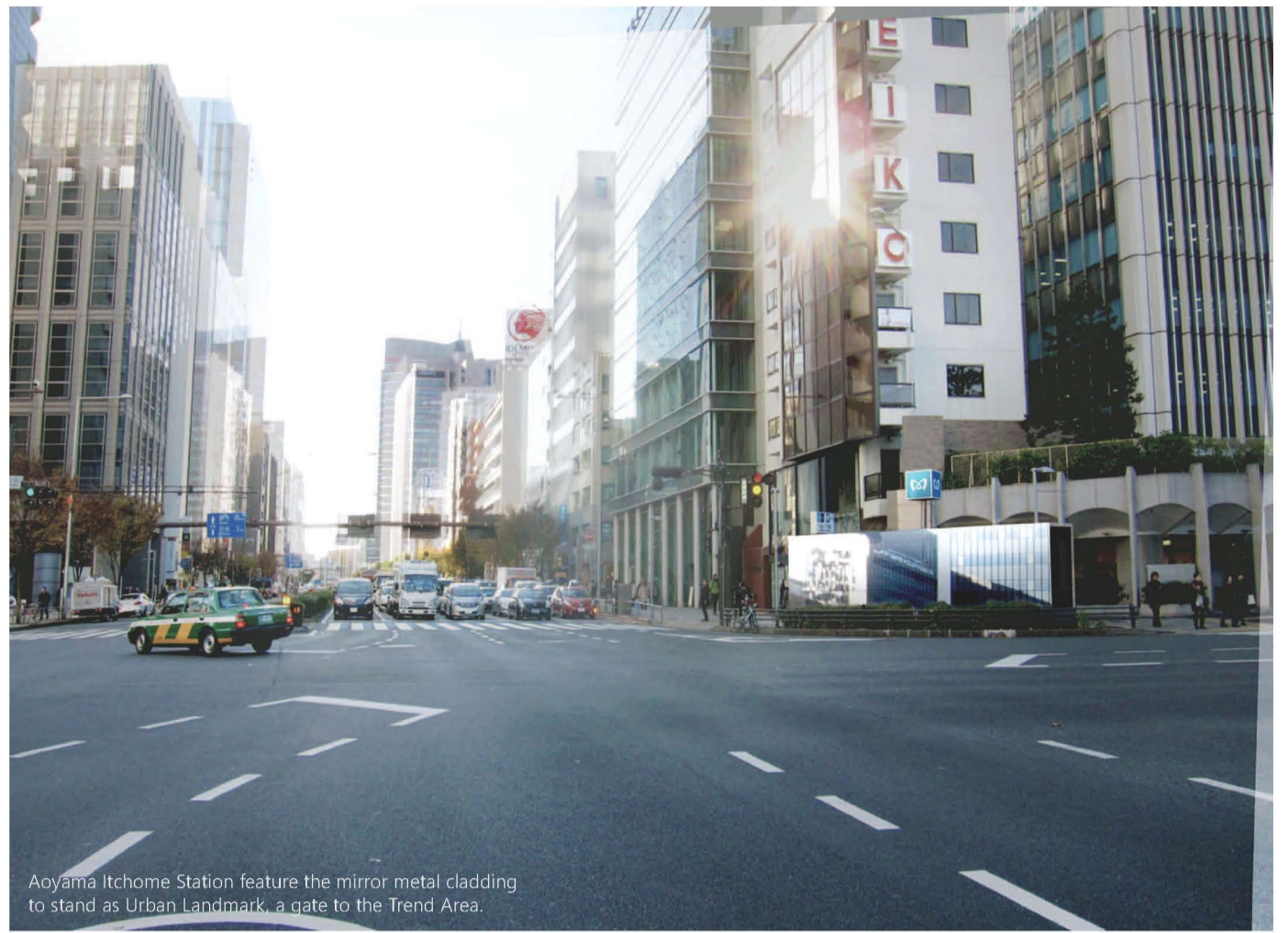
Aoyama Itchome Station feature the mirror metal cladding to stand as Urban Landmark, a gate to the Trend Area.